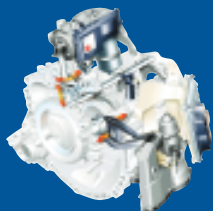
Robotized gear boxes