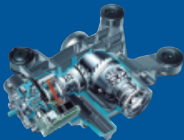
Torque case transfer