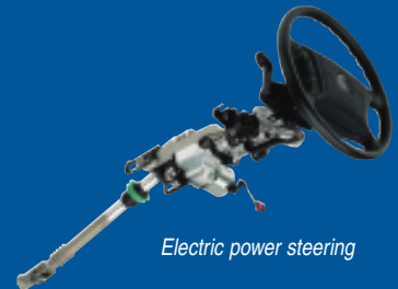
Electric power steering